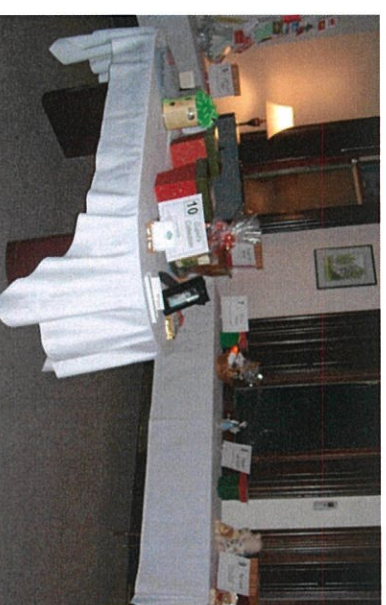
Hat Box Auction Items